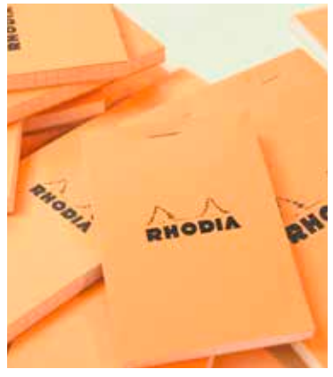
Classic Staplebound The iconic orange and black notepads.