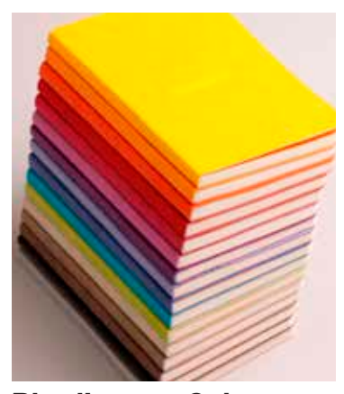
Rhodiarama Colors Between orange and black there is a Rhodia for you.