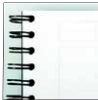
Lined w/ margin on all 4 sides